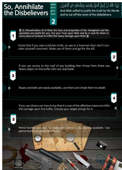
The English-language, pro-ISIS online magazine Voice of Hind called for vehicular attacks in April 2020.

Following the wave of vehicular terrorist attacks in 2016 and 2017, ISIS has continued to issue calls to violence and warnings of additional car-ramming attacks. On May 17, 2017, the group released a video threatening attacks in the United Kingdom, Europe, and the United States, especially in New York, Las Vegas, and Washington, D.C. ISIS has also threatened and encouraged vehicular attacks on gay pride parades. 47 In June 2017, an account operating under the name of ISIS’s Nashir agency released a renewed call for ISIS supporters to “[r]un over people by vehicles and [c]ut off their necks in any time [sic].” 48 In April 2020, the third issue of pro-ISIS online magazine Sawt al-Hind (Voice of India) issued a new call for vehicular attacks as one of multiple inexpensive and easy ways to attack non-believers. 49