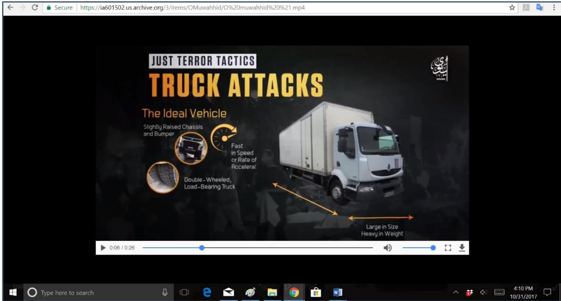
A 26-second video clip on truck attacks available on the Internet Archive, taken from the longer ISIS video “We Will Surely Guide Them to Our Ways,” (originally released May 17, 2017). CEP located the clip October 31, 2017.

In September 2014, ISIS spokesman Abu Muhammad al-Adnani issued a call to kill non-believers using any means at their disposal. “[S]ingle out the disbelieving American, Frenchman, or any of his allies,” he said. “Smash his head with a rock, or slaughter him with a knife, or run him over with your car.” 43 In November of that year, French foreign fighter Abu Salman al-Faranci appeared in a video reiterating ISIS’s call for followers—particularly in France—to carry out domestic attacks if they could not join ISIS abroad. As Faranci said to his viewers: “Terrorize them and do not allow them to sleep due to fear and horror. There are weapons and cars available and targets ready to be hit.” 44