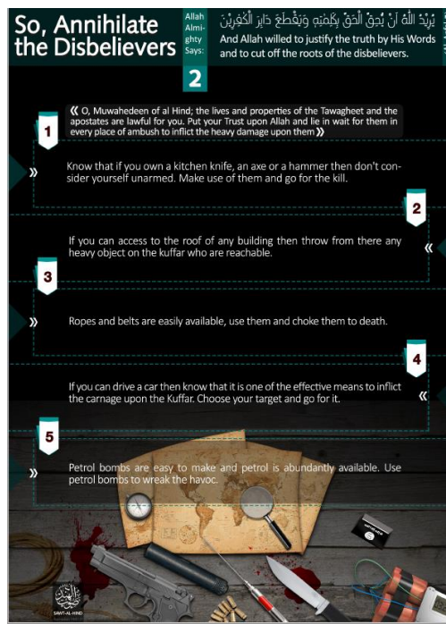
The English-language, pro-ISIS online magazine Voice of Hind called for vehicular attacks in April 2020.

Following the wave of vehicular terrorist attacks in 2016 and 2017, ISIS has continued to issue calls to violence and warnings of additional car-ramming attacks. On May 17, 2017, the group released a video threatening attacks in the United Kingdom, Europe, and the United States, especially in New York, Las Vegas, and Washington, D.C. ISIS has also threatened and encouraged vehicular attacks on gay pride parades. 47 In June 2017, an account operating under the name of ISIS’s Nashir agency released a renewed call for ISIS supporters to “[r]un over people by vehicles and [c]ut off their necks in any time [sic].” 48 In April 2020, the third issue of pro-ISIS online magazine Sawt al-Hind (Voice of India) issued a new call for vehicular attacks as one of multiple inexpensive and easy ways to attack non-believers. 49