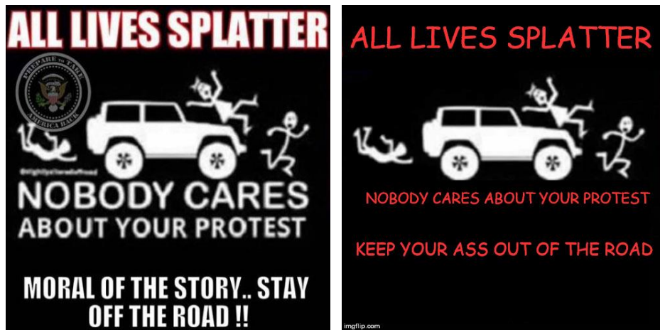
“All Lives Splatter” meme mimic the slogan Black Lives Matter.

delegitimize the protests, which broadly support values anathema to the far right such as racial equality and the Black Lives Matter movement specifically. Online memes promote the perversion of the “Black Lives Matter” slogan into “All Lives Splatter,” with depictions of cars driving into protesters. Other memes portray protesters as deserving of being hit by cars while demonstrating in the streets and creating inconveniences to non-protesters. For example, memes in this category praise the idea of running over protesters to avoid being late to work. There is also an attempt to normalize the idea that protesters should expect to be struck by vehicles when protesting in the streets. Multiple memes in this category use celebrity images to express faux shock that protesters are hit by cars while standing in the street. Others revel in hitting demonstrators or portray vehicles covered in blood while proclaiming the drivers encountered speed bumps but did not see any protesters.