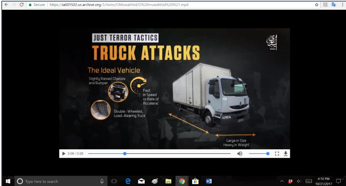
A 26-second video clip on truck attacks available on the Internet Archive, taken from the longer ISIS video “We Will Surely Guide Them to Our Ways,” (originally released May 17, 2017). CEP located the clip October 31, 2017.