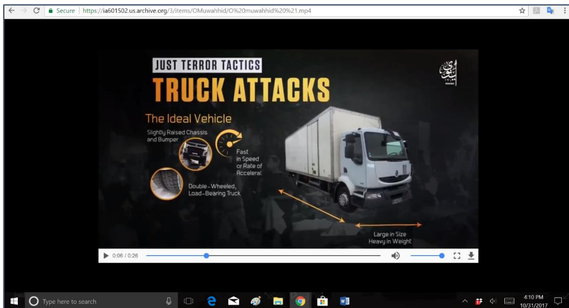
A 26-second video clip on truck attacks available on the Internet Archive, taken from the longer ISIS video “We Will Surely Guide Them to Our Ways,” (originally released May 17, 2017). CEP located the clip October 31, 2017.