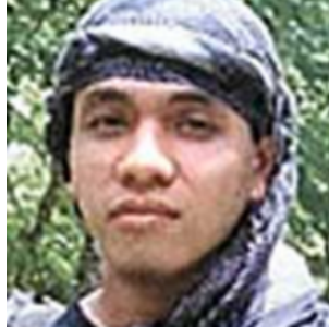
Khadaffy Abubakar Janjalani

Former emir and senior leader, confirmed dead