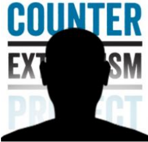
Abdurajak Abubakar Janjalani