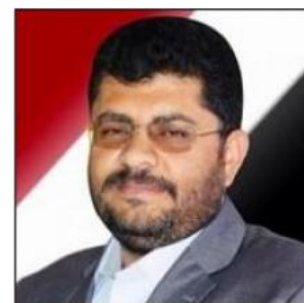
Mohammed Ali al-Houthi

Spokesman and member of the Houthi Political Council