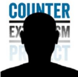
Abu Dujanah al-Tunissi Senior figure, deceased