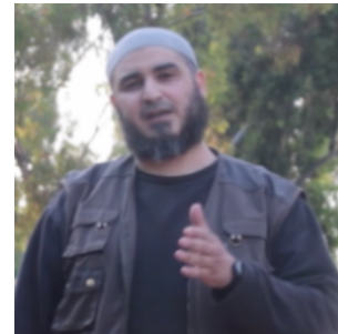
Abu al-Bara' al-Tunisi