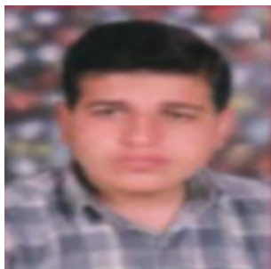
Khaled al-Aruri (a.k.a. Abu al-Qasim al-Urduni)