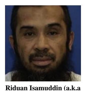
Hambali) Operational leader, head of regional shura, suspected al-Qaeda operations director for East Asia, now in extrajudicial detention at Guantanamo Bay