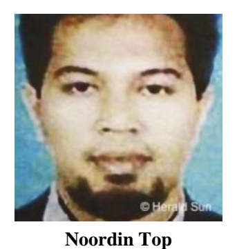
Top recruiter, one of the masterminds behind the August 2003 attack on Marriott Hotel and September 2004 car bomb outside Australian Embassy in Jakarta, reportedly killed by Indonesian police in Java on September 17, 2009