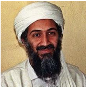
Osama bin Laden