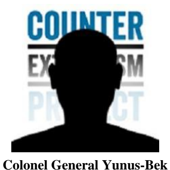
Russian Deputy Minister of Defense and Lead Supervisor of Africa Corps in Libya